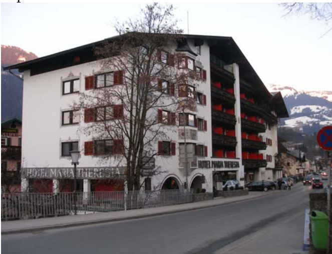
Hotel Maria Theresia- home away from home for the week

Schnapps in white igloo bars and Stiegl in tall glasses ... snowflakes that stuck to our noses and eyelashes ... or at least they stuck to the snow-capped peaks of the Tyrolean Alps! It's safe to say that the 61 MSA travelers who descended on the Hotel Maria Theresia in the medieval town of Kitzbühel, Austria in mid-February found many of their own favorite things. Happy Hour at The Londoner, a lively competition with some Germans at "the stump game" at Chizzo's, or a late night pub crawl to Flannigan's ... all after full days of traversing from peak to peak over the expansive terrain throughout the entire area surrounding "Kitz". Some of the bravest skiers and boarders took their crack at the world famous Hahnenkamm downhill run, which hosts the World Cup each year, while others strapped on their boards and headed out on the formidable day-long "ski safari". Some people prided themselves on finding the perfect shneebar to warm their insides with a bit of Jägermeister, while others went to many of the cozy restaurants dotting the hillsides in search of the perfect Kaiserschmarren or wurst.